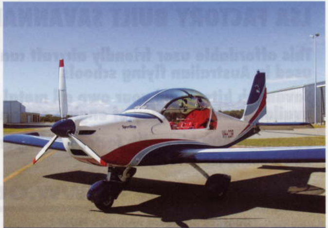
Cloud Dancer, an Evezkor Sportstar, is the first LSA in Australia